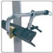
The adjustable magnet pad can securely hold on to angle iron