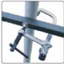
Stays in place while you tighten. Ideal for one-handed clamping